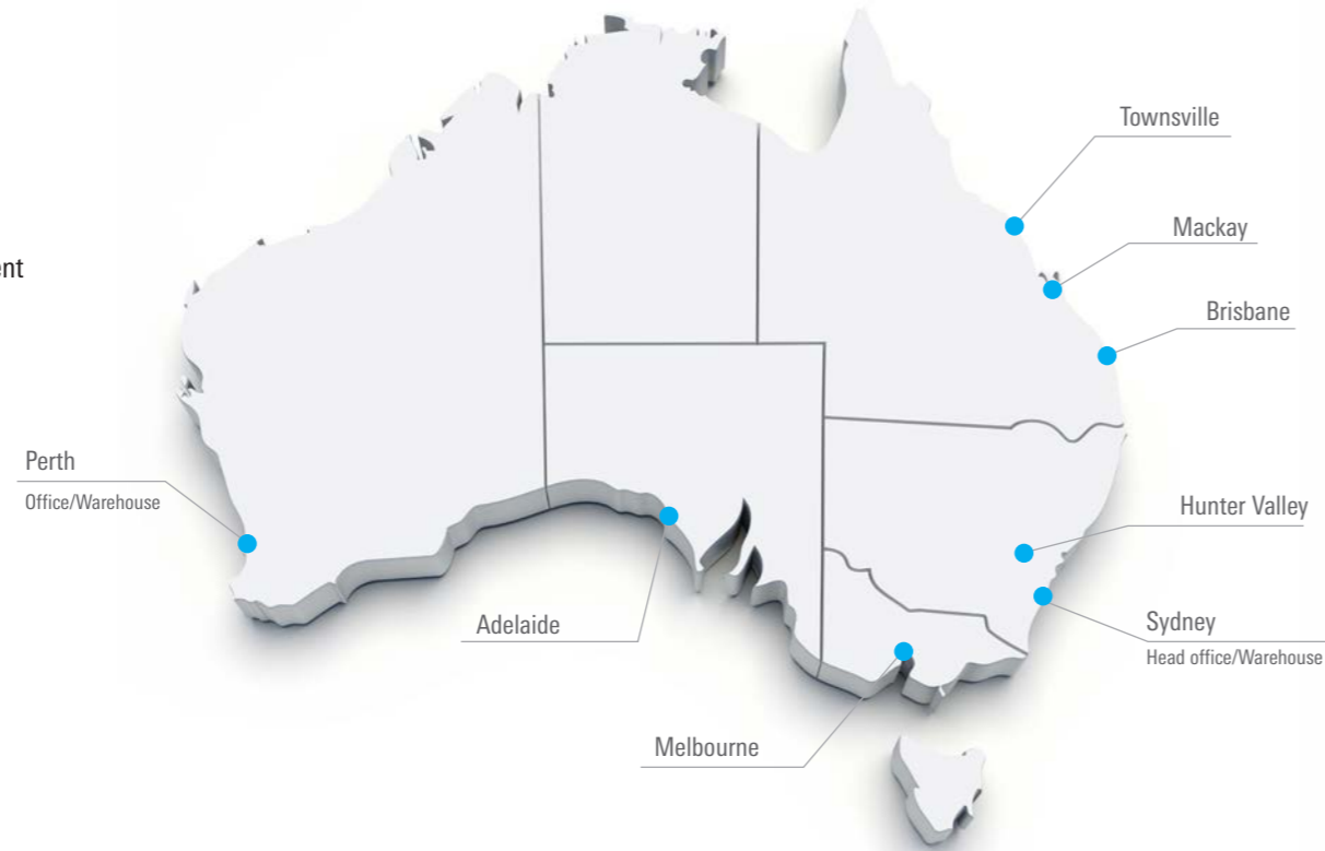
Sydney Head Office